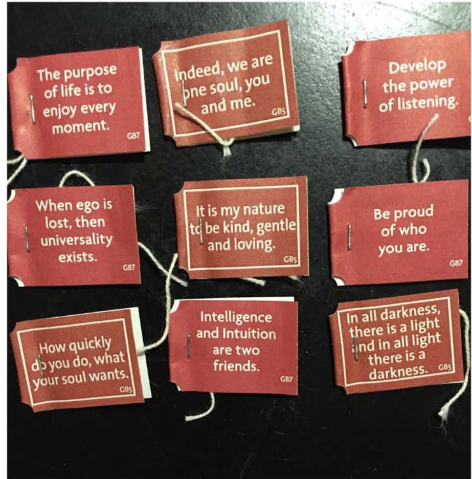
The small quotes on the morning teabags gave us a daily mantra.