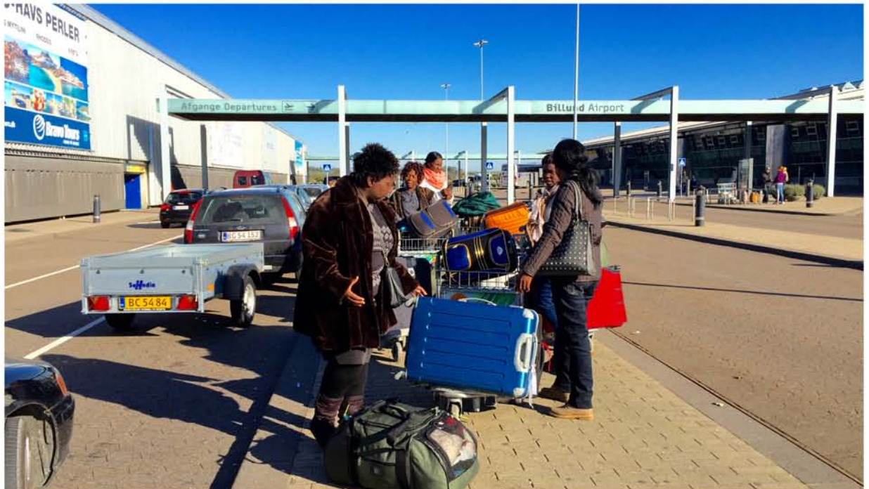
Going back to Zimbabwe with maximum luggage allowance!