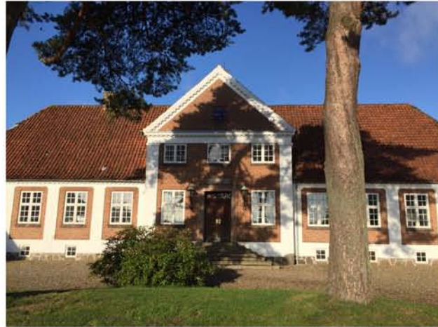
LWC at Vissinggard 2015